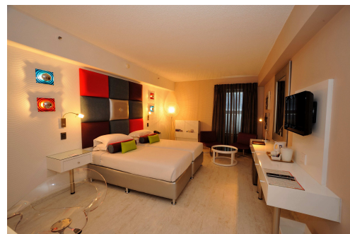
CTW (Classic Twin Room)