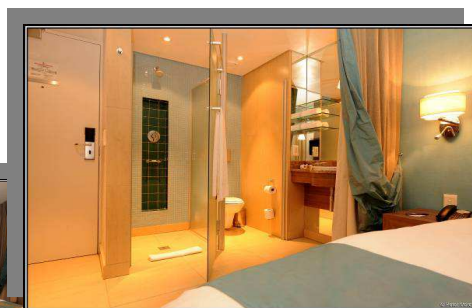
CTW (Classic Twin Room)

64 Jones Road . Kempton Park . South Africa . P O Box 956 . Kempton Park . 1620 . South Africa Tel +27(11) 928 1000 . Fax +27 (11) 928 1702