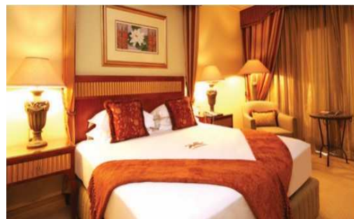
CKI (Classic King Room)