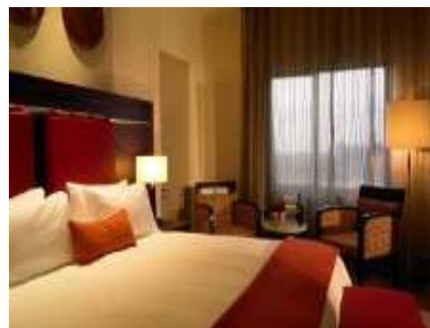
SKI (Superior King Room)

64 Jones Road . Kempton Park . South Africa . P O Box 956 . Kempton Park . 1620 . South Africa Tel +27(11) 928 1000 . Fax +27 (11) 928 1702